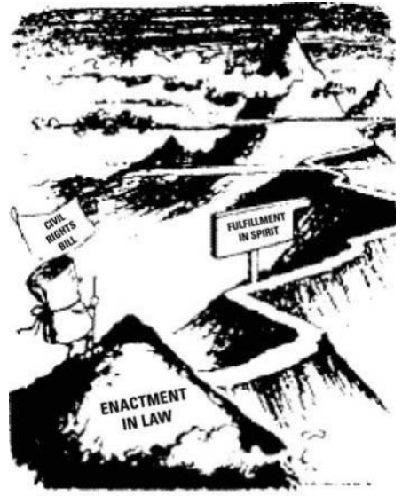
There's a long, long trail a winding

14. Circle the decade in which you believe this cartoon was drawn.