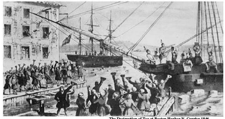
The Destruction of Tea at Boston Harbor, N. Currier 1846 Museum of the City of New York, The Harry T. Peters Collection.